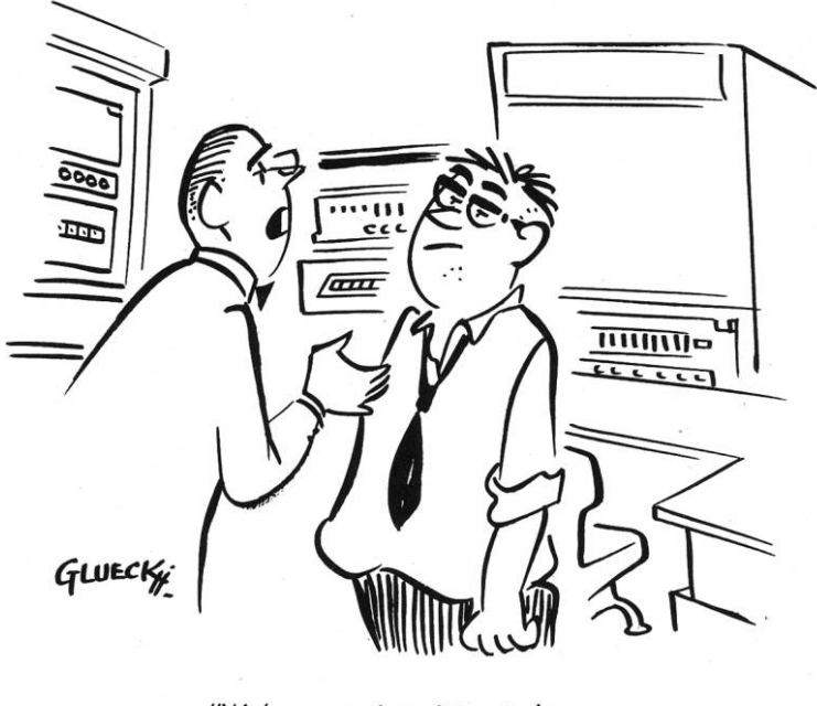
"We're expecting vistors today so shave, comb your hair, wash up, polish your shoes and stay out of sight . . ."